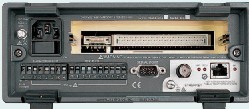
Fluke NetDAQ® rear panel (Universal Input Module removed)